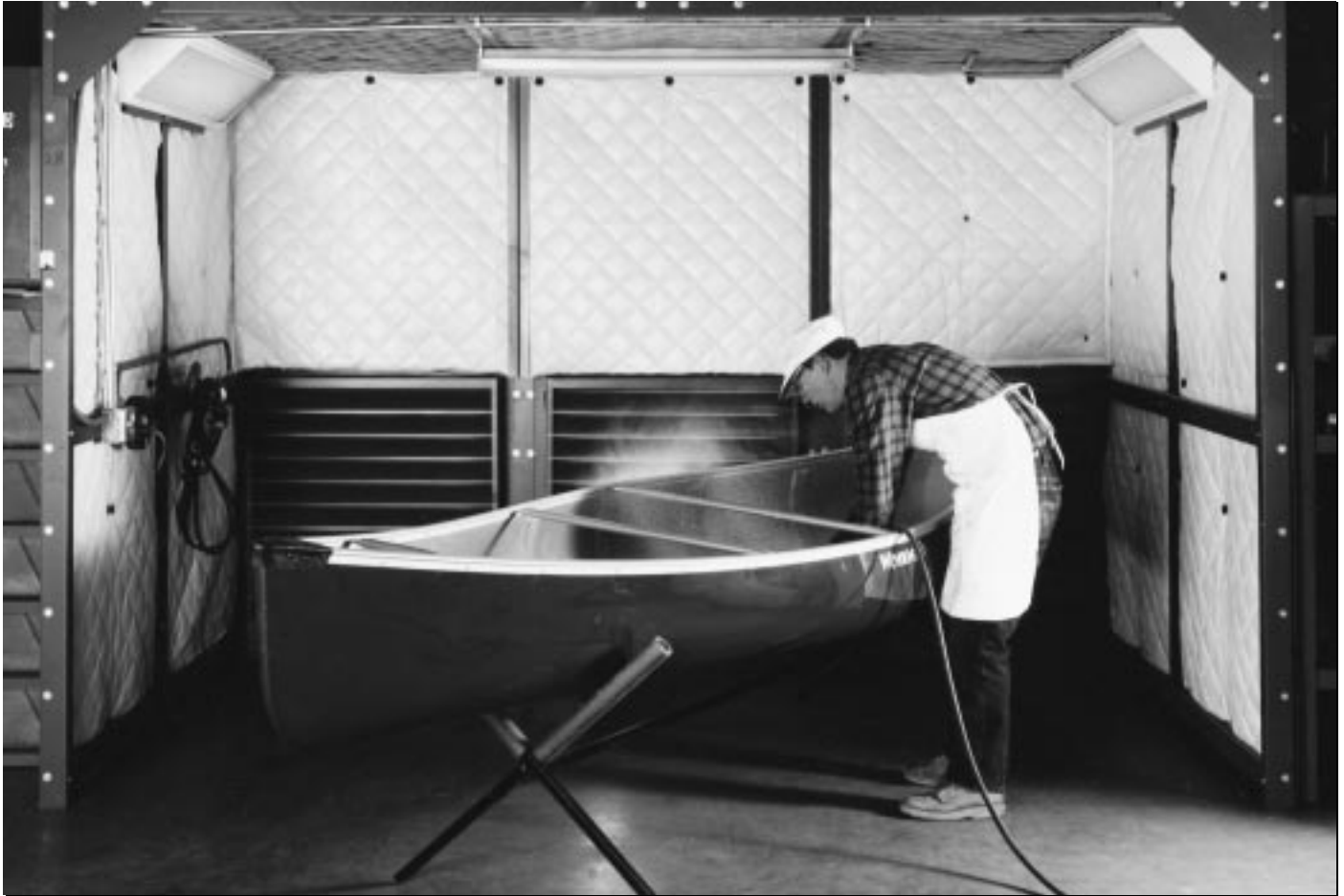
Barricade QFA-10 (White) reduces noise levels inside and around this environment control booth.