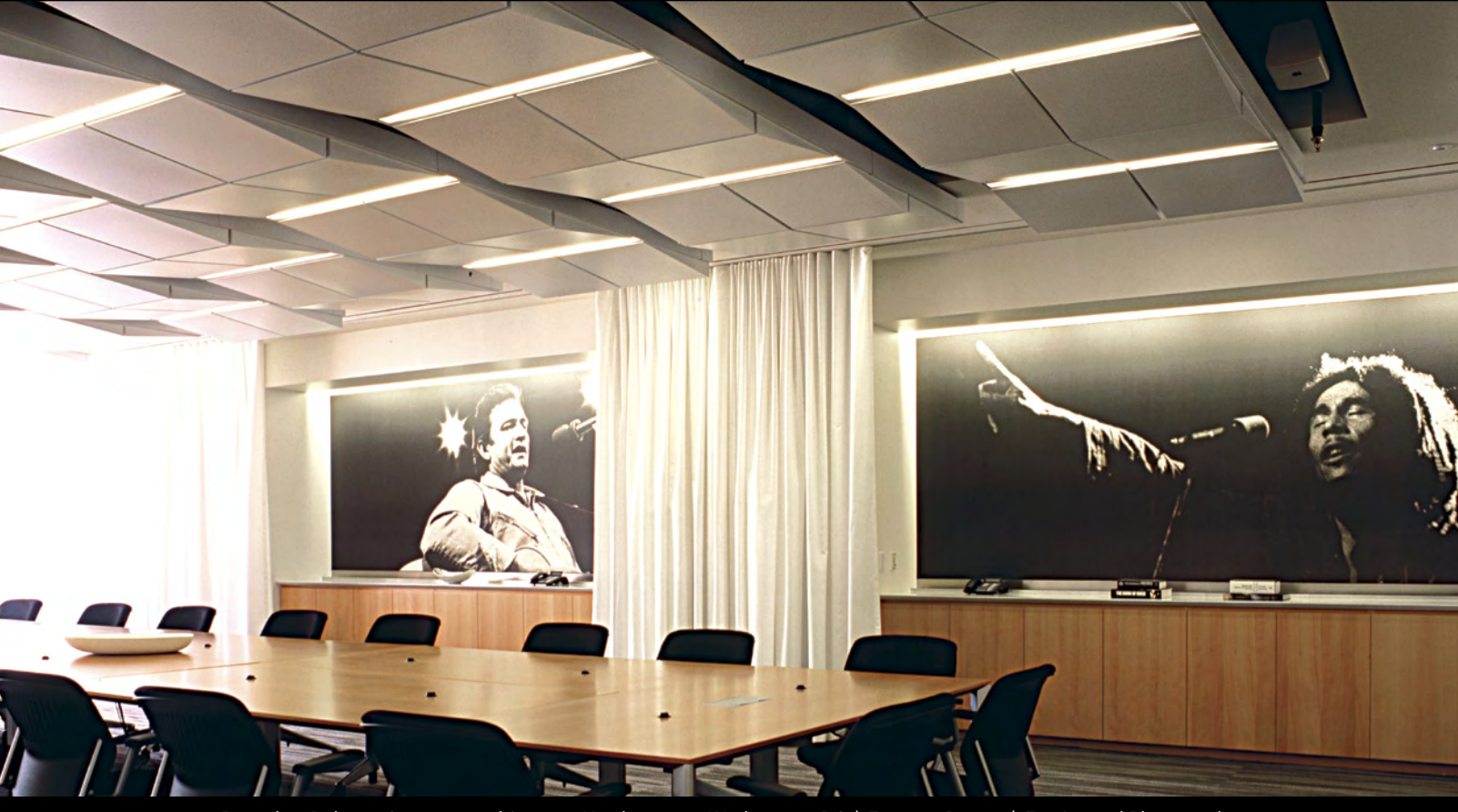
Recording Industry Association of America Headquarters, Washington, DC | Envision Design