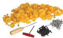
CLIP & VELCRO