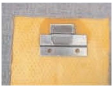
2-PART MECHANICAL CLIPS