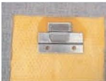
2-PART MECHANICAL CLIPS