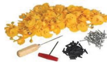
CLIP & VELCRO