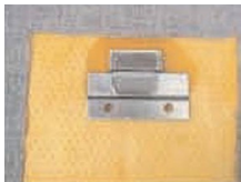
2-PART MECHANICAL CLIPS