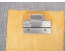
2-PART MECHANICAL CLIPS