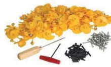
CLIP & VELCRO